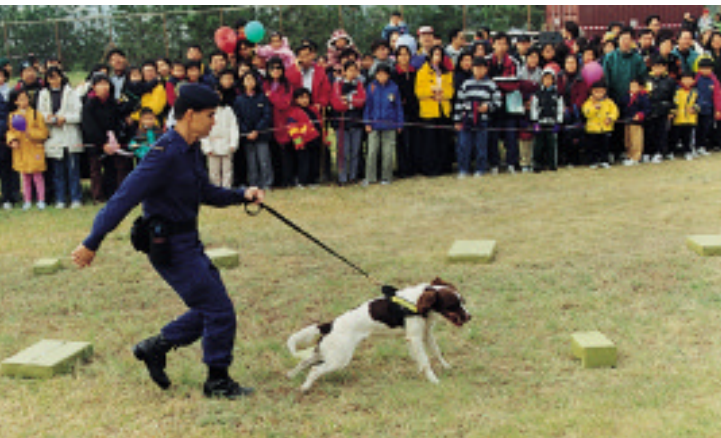
香港海關 - 緝毒犬表演

Customs & Excise Department display - Dog and handler search for narcotics