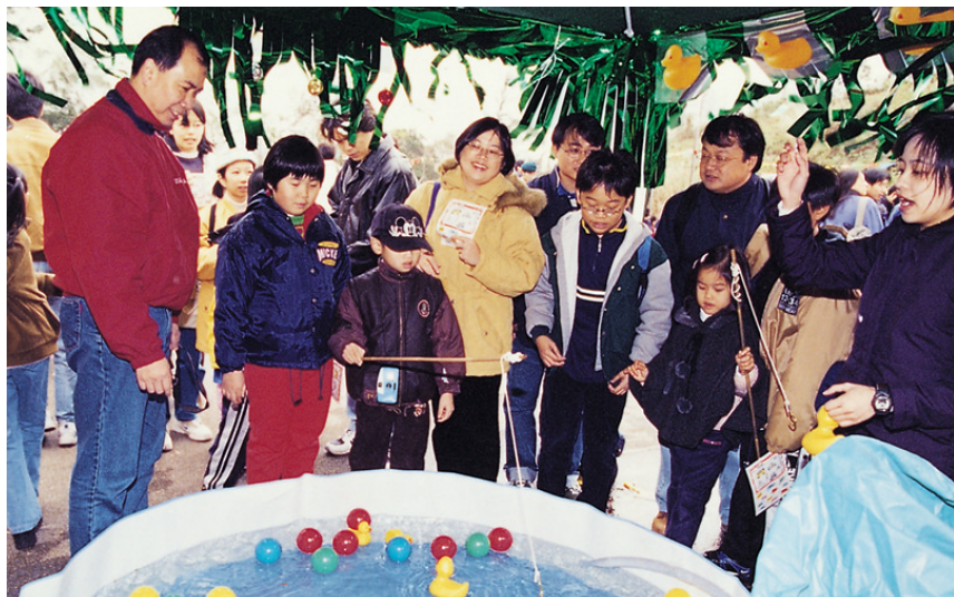
一家大小齊參與 Fun for the family !