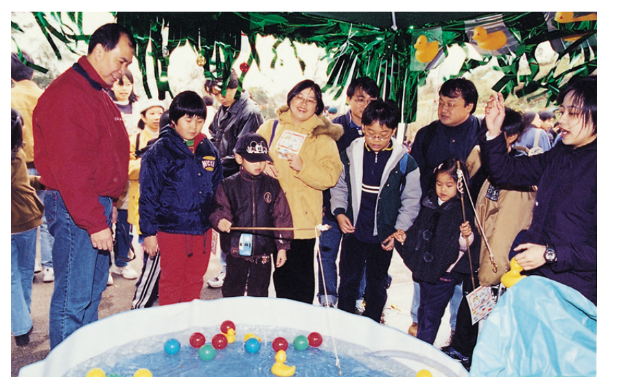
一家大小齊參與 Fun for the family !