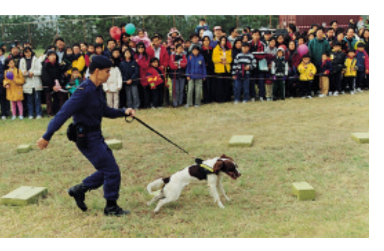
香港海關 - 緝毒犬表演 Customs & Excise Department display - Dog and handler search for narcotics